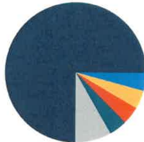
% of Incidents per Zone

Incident Status: Reviewed | Start Date: 02/01/2022 | End Date: 02/28/2022