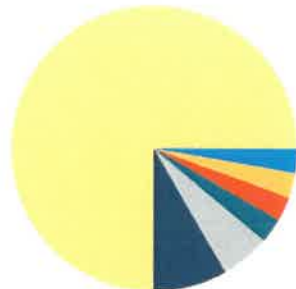
% of Incidents per Zone

Incident Status: Reviewed | Start Date: 06/01/2022 | End Date: 06/30/2022